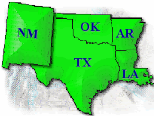
Map of FEMA Region VI

A protest is an objection to any information, other than BFE's, shown on an National Flood Insurance Program (NFIP) map that is submitted by community officials or interested citizens through the community officials during the 90-day appeal period.